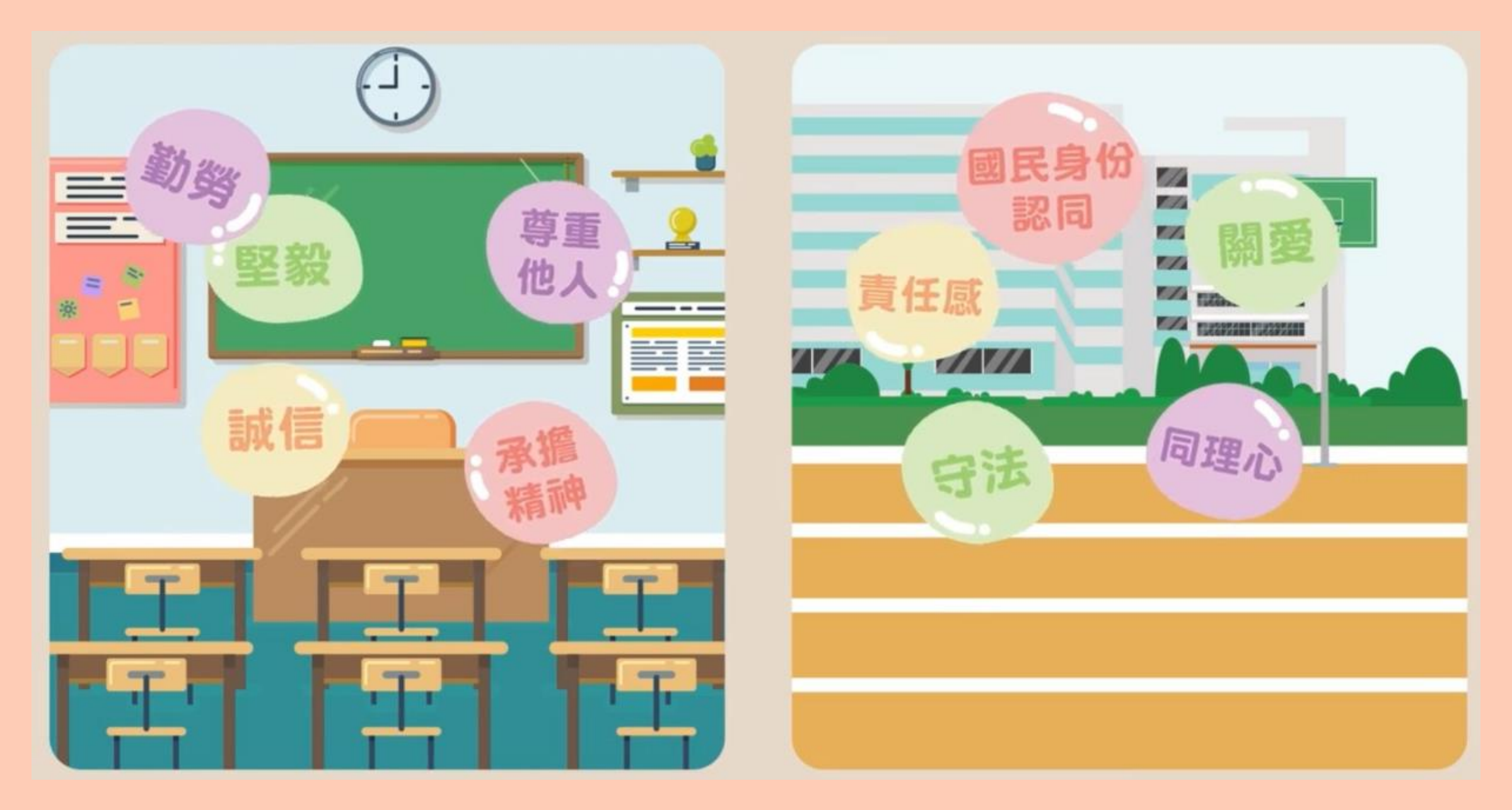
Ten Priority Values and Attitudes