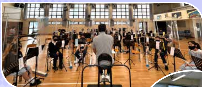
Symphonic Band meeting after two years