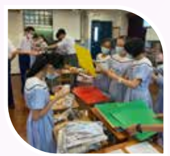
Students were selecting materials that were useful in their work