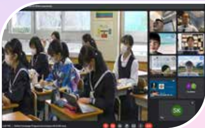
Japanese students are very focused while having an online exchange session with our Lamwoopers