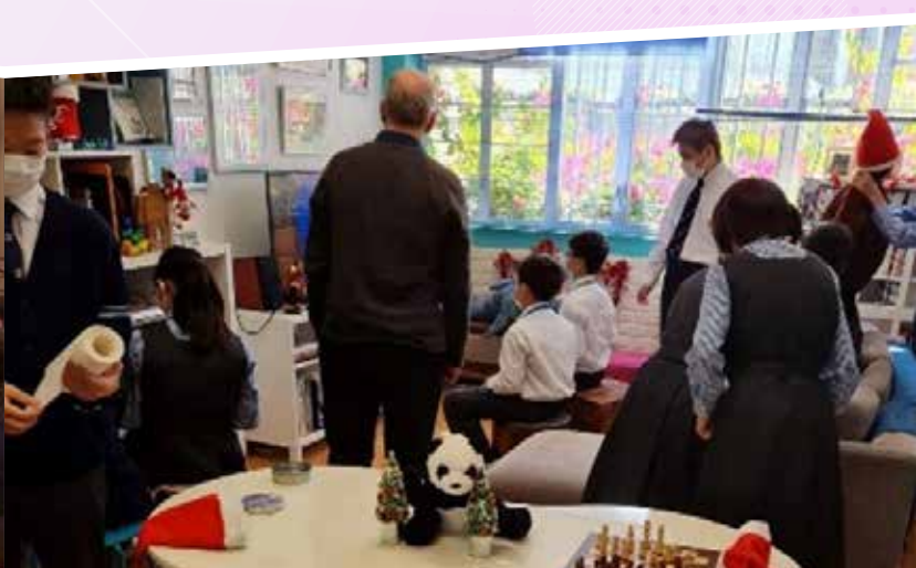
Some junior form students relaxing during recess and decorating the English Corner for Christmas.