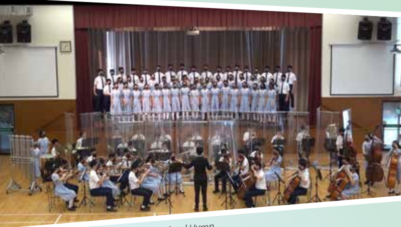
Orchestra and Choir play the School Hymn