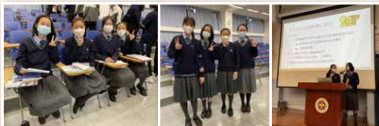
學生升學及就業輔導組（SCT）的幹事與高中同學分享海外升學資訊

在學期中，我與「學生升學及就業輔導組」的幹事一起到中四級早會分享有關海外升學的資訊，講解海外升學途徑和注意事項，並介紹一些海外升學考試，如TOFEL、IELTS等，讓有志到外地升學的中四同學早作準備。在籌備及推展整個活動的過程中，我們學習如何在不同網站、書籍，搜集和整合相關資料；更有機會進行公開演說，提升了個人自信心和說話技巧，真的獲益良多。