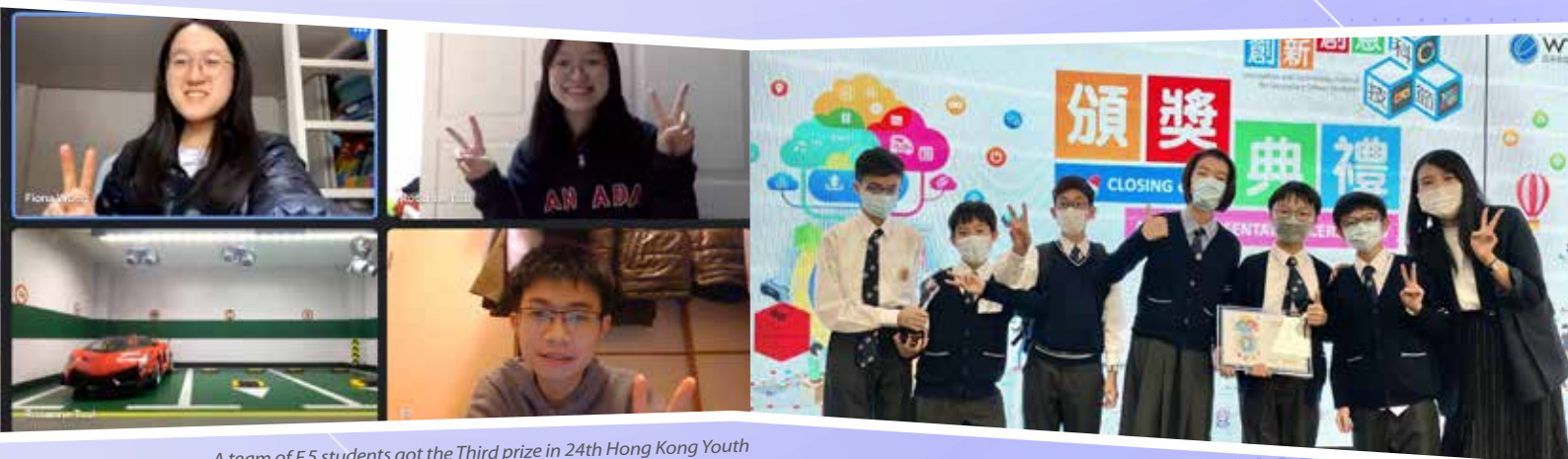
A team of F.5 students got the Third prize in 24th Hong Kong Youth Science and Technology Innovation Competition