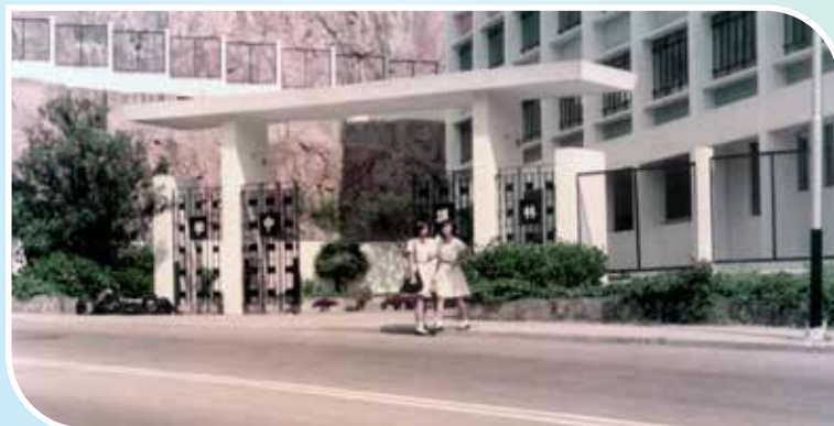
Old Photo slide show

and janitor, Uncle Man 文叔. There were 257 viewers in our live broadcast, and over 3500 views on Youtube. Snap the QR code if you would like to watch the programme again.