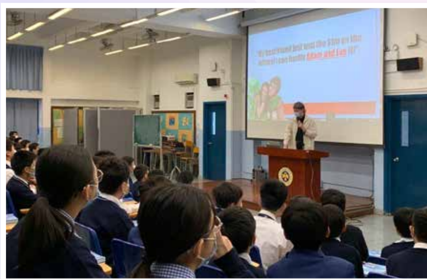
Here F1 students are enjoying an interactive assembly in the lecture theatre about fun and creative ways to learn English outside of school.