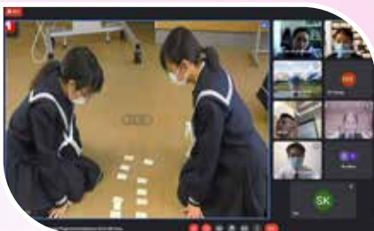
Interesting Japanese card game!