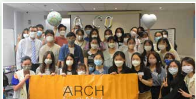
ACO「Careers Program 2022」參與者的大合照

很開心能獲選參加由ACO 舉辦的「Careers Program 2022」。在參與「撰寫履歷工作坊」中，專業導師與我們分享撰寫個人履歷的要點，例如履歷格式、內容重點等，為我未來申請大學做好準備。在8月份，ACO更會和私人公司合作舉辦「工作影子計劃」，讓我們親身體會職場生活，有助認清自己志向。同時，我認識到更多來自不同中學的新朋友，擴闊社交圈子，收穫一眾好友。！