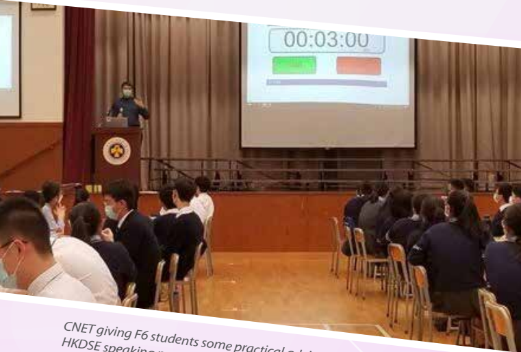
CNET giving F6 students some practical advice during a whole-form HKDSE speaking paper practice.