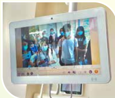
參觀香港中文大學醫院

同年，我還參加香港輔導教師協會舉辦的「暑期事業體驗計劃」，有機會參觀香港中文大學醫院，並和放射治療師進行對話。這次參觀讓我感受到科技進步為人們帶來的便利，以及了解現今醫療體制發展走勢。