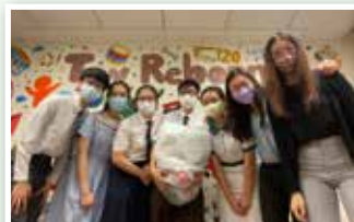
BOUNDLESS組員和師友大合照

由香港基督教青年會資助推展的「BOUNDLESS計劃」，旨在為中四及中五學生提供指導和培訓機會，以幫助學生為未來做更好的規劃。計劃包括下列項目：本地及海外師友計劃、大學與獎學金申請指南、面試和履歷表寫作工作坊、工作實習機會和海外志願服務等。以下是本校其中兩位同學參加活動後的感想：