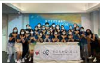
The Project — 以塑膠污染為主題的展覽活動