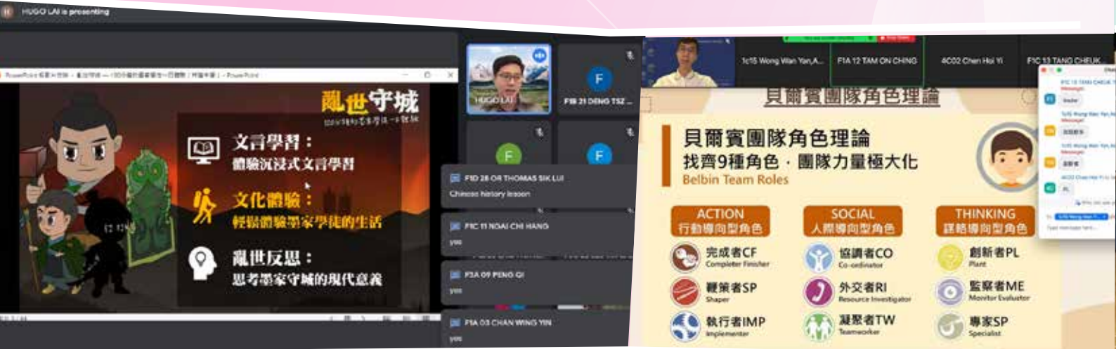
「亂世守城 — 100分鐘的墨家學徒一日體驗」講座