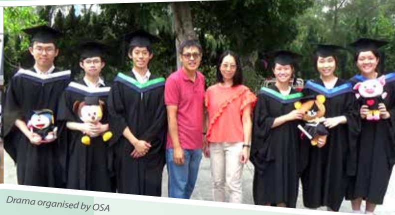
Drama organised by OSA