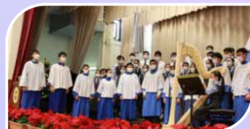
Robed ensemble at Christmas Service