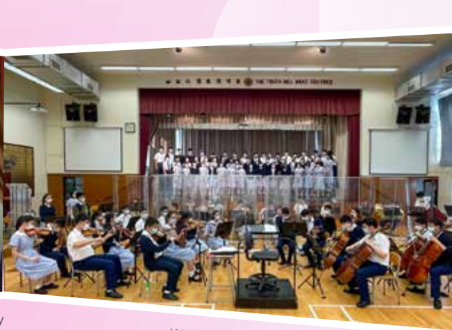
Warming up for Online Open Day Recording