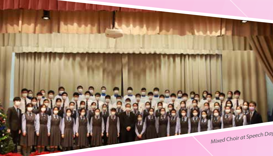
Mixed Choir at Speech Day