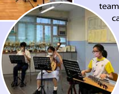
Recording for Joint-school Chinese Orchestra