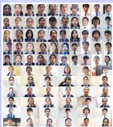
Mixed Choir at Speech Day

Despite another suspension of face-to-face rehearsals and live performances due to the fifth wave of the pandemic, our Junior Choir and Mixed Choir did not stop making music at home but had their first try as a 'virtual choir' to 'perform' at the Ebenezer School's Singspiration Concert of Ebenezer Jockey Club Music Odyssey. The Virtual Choir video is also available on our school website.