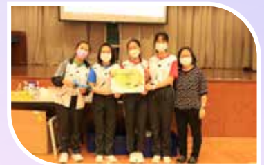
A team of F.2D girls achieved champion in the activity

The Integrated Science Department hosted Rocket Car Competition Fun Day for all F.2 students on 8 July 2021. Not only did students learn science-related knowledge, they also gained hands-on experience in designing and building model rocket cars. Students needed to take part in an engineering design process, including research, design, building, testing and improvement.