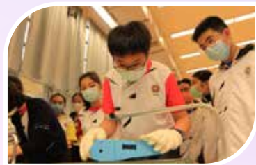
F.2 students were making their rocket cars using the hot wire cutter