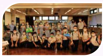
4 Teams of F.1 students designed their products

IET Faraday Challenge Day 2021 was held by the CL & ICT Department on 14 July 2021. Four teams of F.1 students designed and programmed their products. It provided opportunities for students to work in co-operation and cultivate their creativity and problem-solving skills as responsible individuals.