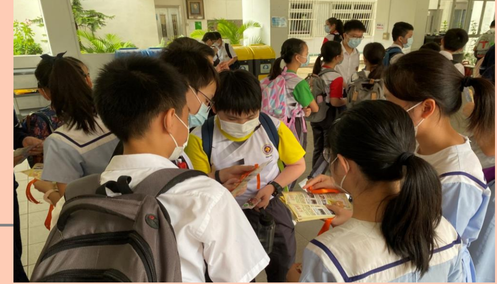
Orange Ribbons Campaign – Supporting World Stroke Day

Sending Cheers to the Elderly at Christmas – Outside School Service